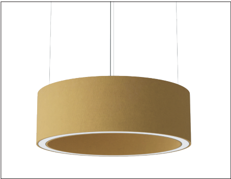
FR - FLUSH REGULAR