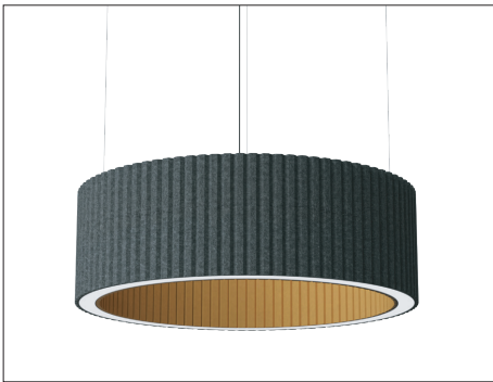
FV - TWO TONE 04/11

Available in 12 inch height and 2 feet size only .