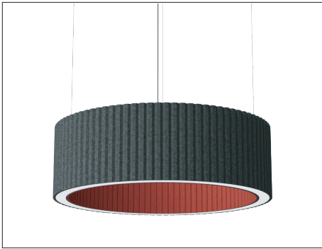
FV - TWO TONE 04/25