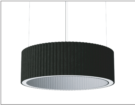
FV - TWO TONE 09/24