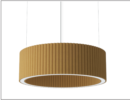
FV - FLUSH V-CUT