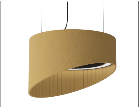
RA - RECESSED ANGLE

Available in 12 inch height and 2 feet size only .