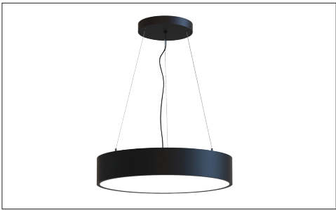
SUSPENDED - CEILING CANOPY