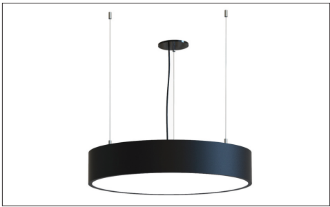
SUSPENDED - STRAIGHT WIRE