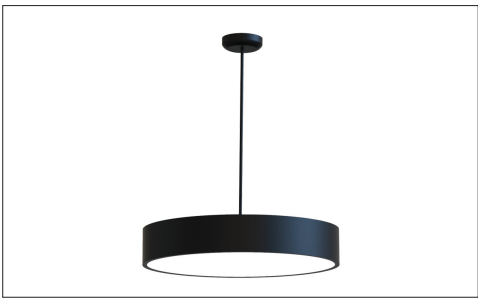
SUSPENDED - STEM