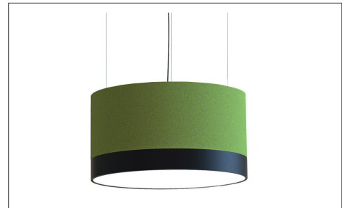
ON - LAY ON