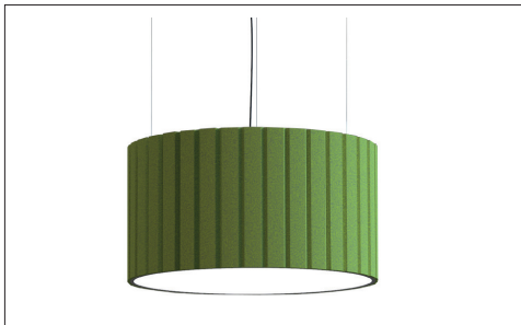
IV - IN VCUT